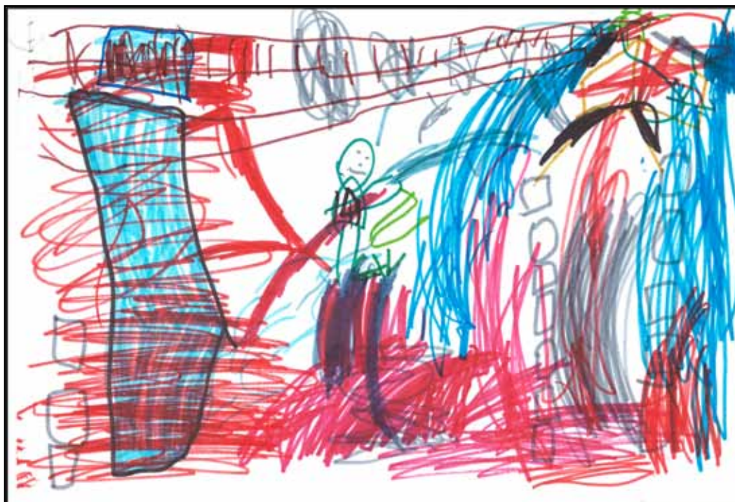
◀ A drawing produced by a six-year-old research participant at Warrandyte, Victoria.

Note: The data collection for this research was completed in December 2008. Thus, children's knowledge and understanding had not been affected by the high profile Black Saturday bushfire disaster of February, 2009.