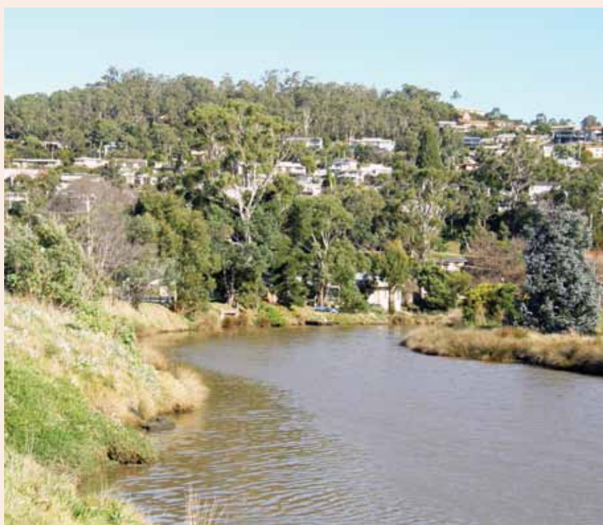
▲ Browns River at Kingston, Tasmania. Kingston was identified as a suitable locality for a case study as it is deemed an area at risk of bushfire and fulfilled the other criteria of population size and bushfire suppression capability.