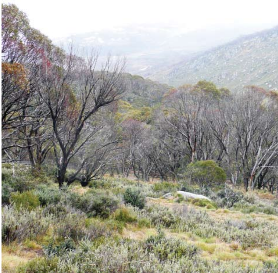
▲ Fifty-year-old snowgum forest adjacent to the six-year-old growth. Canopies are mature and Bossiaea foliosa has been replaced by a more open layer of Helichrysum thyrsoideum .

because it contains little dead material. However, the model predicts that dense, low, green regrowth can produce dangerous fire conditions, where fire spread can suddenly change from low intensity to very fast “heath”-like fires. This has been well supported by field observation in recent years.