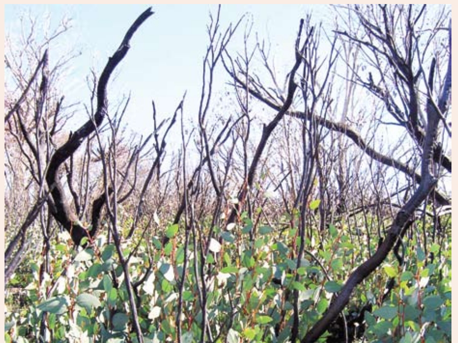
▲ Regrowth from three year-old snowgum coppice burnt in 2006.

Plants make up the majority of most fuel arrays, so just as indigenous fire managers watched the plants to know whether fire should be introduced or not, effective fuel management may only be possible with an adequate understanding of their fire ecology and the dynamics of moisture and growth.