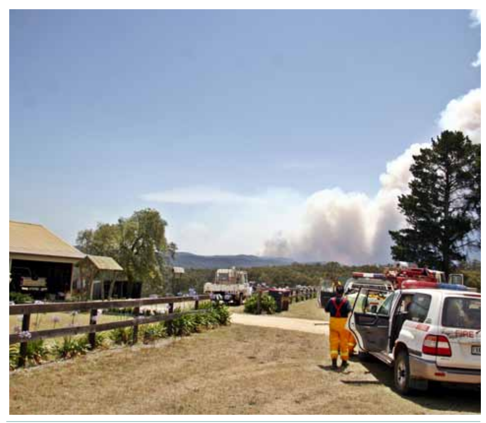
Different psychological processes of individuals are responsible for the choices residents make when threatened by fire.