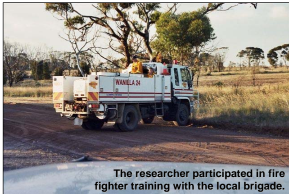
The researcher participated in fire fighter training with the local brigade.