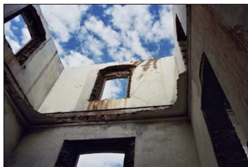
An interviewee provided access to the remains of the historic Greenpatch homestead.

Interviews are being analysed with particular focus on the roles and dynamics within the family unit. This qualitative project delves into decision-making and the assumptions that underpin the 'prepare, stay and defend or go early' policy.