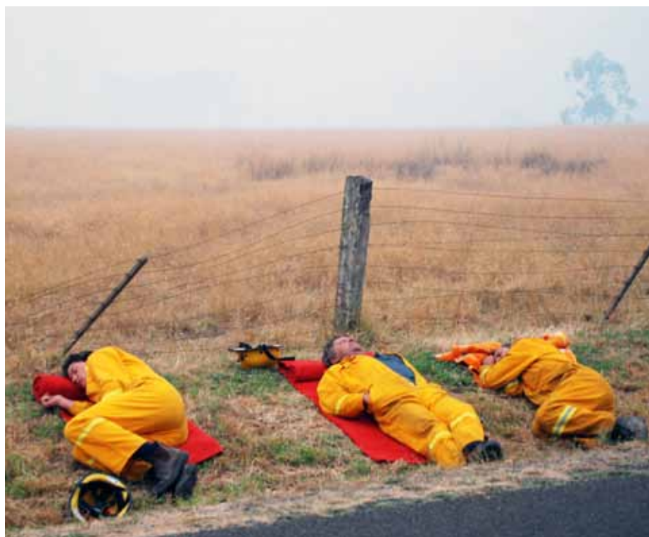
▲ The study is investigating if shorter, more frequent shifts will help reduce fatigue on the fire ground.

Sustained operations shifts may be of use in