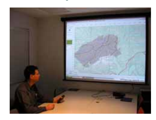
Figure 4. Example of an NFC experimental session in progress

These findings suggest that NFC is likely to be suitable for the investigation of a range of potential errors in decision making.