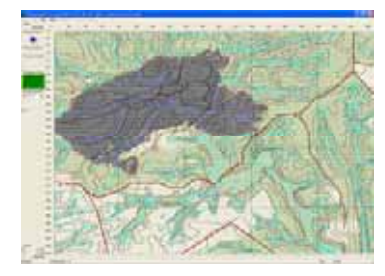
Figure 2. Fire spreading over a complex landscape

The participating wildfire instructors reported getting caught up in controlling the fires and reported the fire spread as being realistic.