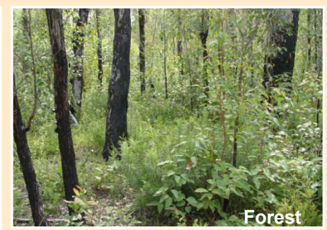
Fig. 1. Vegetation types