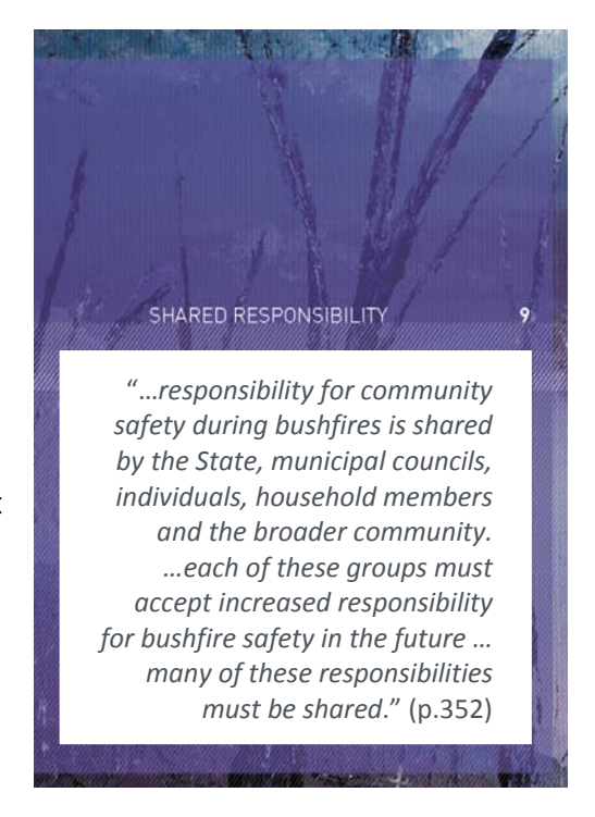
Figure 4.2: Shared responsibility in the final report of the Victorian 2009 Bushfires Royal Commission

The outcomes of this analysis were reported in a manuscript that has been accepted for publication in the Journal of Environmental Hazards . Publication is scheduled for December 2011.